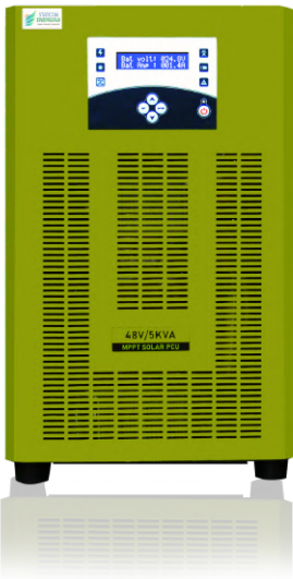
UPCOMING SEOG SERIES 3-PHASE RATINGS

Result: High-performance delivered without interruption, especially in the harsh Indian climate.